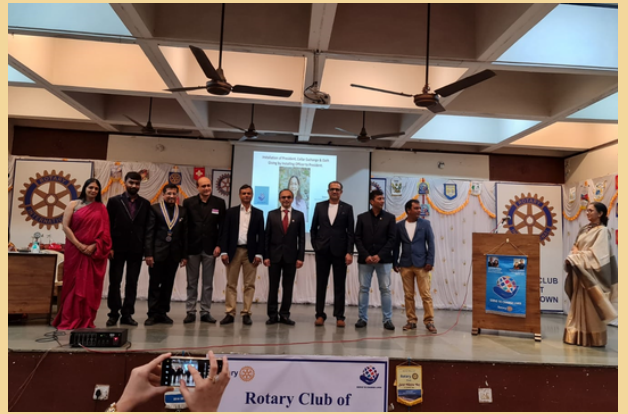
Team for the year 21-22