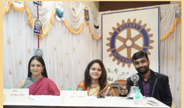
The Pilots of the meeting