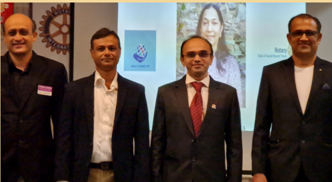
Secretaries, Treasurer with the President