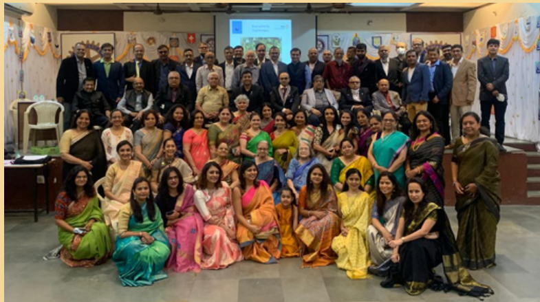
The Proud Roundtowners